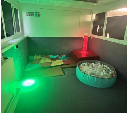
The Purple Room (sensory space)