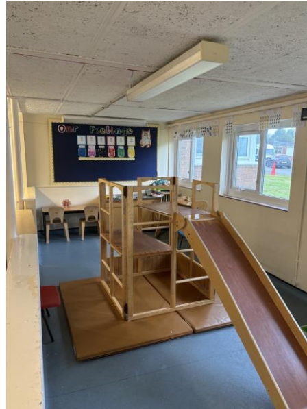
The wet area